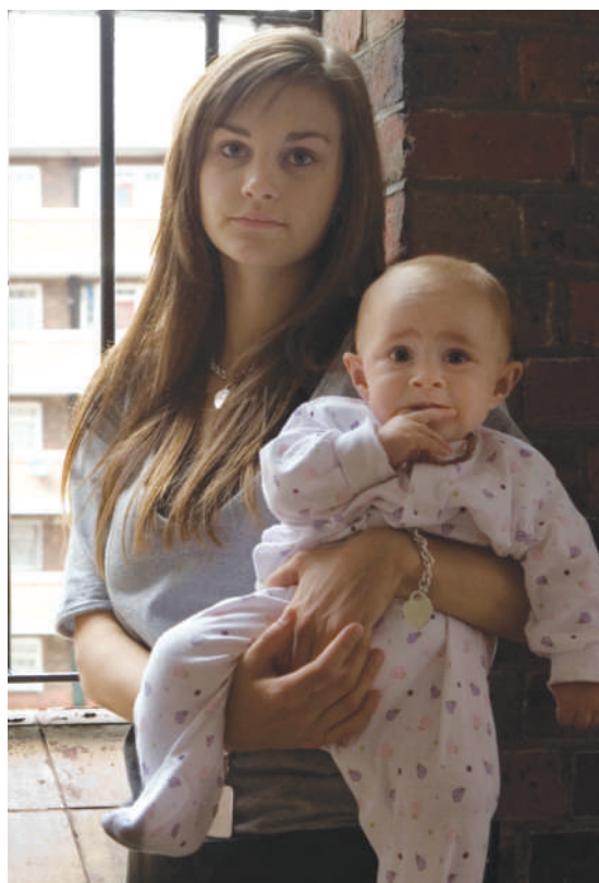
Offering teenagers a dollar for every day they are not pregnant could reduce teen pregnancy rates.