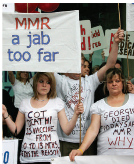
Initial concerns caused many parents to deny their children the potentially life-saving measles-mumps-rubella vaccination.

The problem, as many researchers in cognitive neuroscience and psychology have