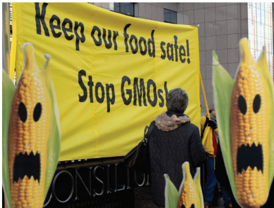
Genetically modified organisms (GMOs) have become the target of overexaggerated safety fears.

"Our ability to de-bias people is quite limited," says Richard Thaler, director of the Center for Decision Research at the University of Chicago in Illinois. Thaler teaches a course in decision-making to MBA students