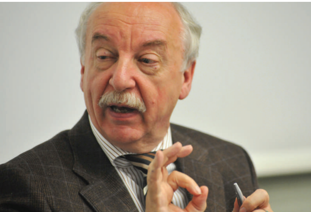
Gerd Gigerenzer thinks that an early education in statistics will go a long way towards helping children to deal with life's uncertainties.

improved people's ability to rationalize everyday problems 3 . That included problems not generally thought of in terms of probabilities, such as whether a group's performance can be predicted from the performance of one or two of its members, or how to infer someone's personality from first impressions.